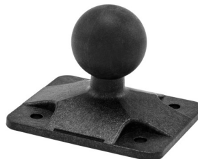
RAM Mount Adapter