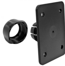
AMPS Socket Plate with Lock Ring