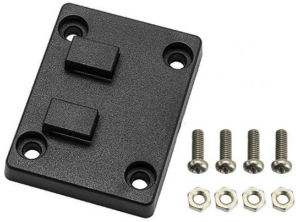
Dual Male AMPS Plate

Step 1 - Locate the bag containing the parts shown below.